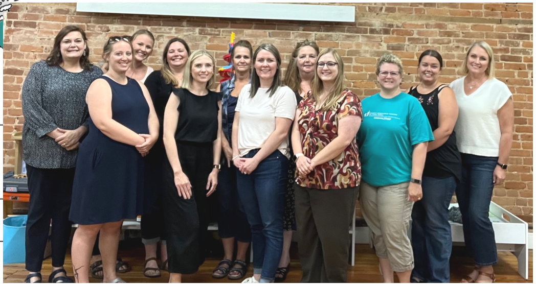
FRCSCV serves families with eleven Parent Educators, three administrative staff and is governed by a 15-member Board of Directors.