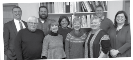
Family Resource Center Board of Directors 2018