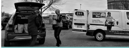
Thank you, United Way for the mobile food pantry and Girl Scout Cookie Donation that benefitted families participating in home visiting.