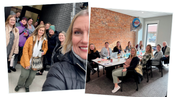
Staff Reveal Day!