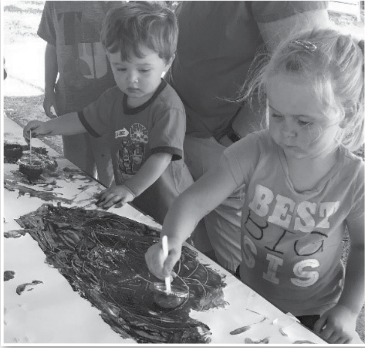
Toddlers and preschoolers enjoy frozen paint on a warm summer day in Centuria.