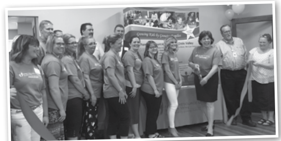
Board, staff and members of the Baldwin-Woodville Chamber of Commerce participated in a Ribbon Cutting at a May 23 Open House celebrating the Family Resource Center's office expansion and remodel.