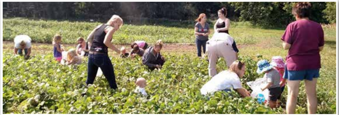
Families picked beans at a 'Plant & Pick' field trip to Threshing Table Farm in July.